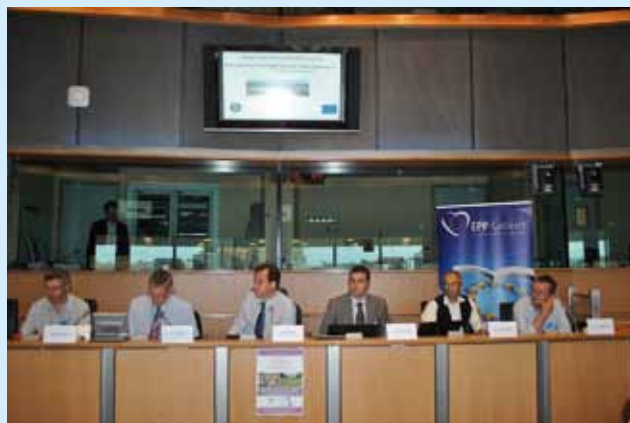
Speakers at the HNV farming seminar in June in the European Parliament.

The room was packed and there were many questions from the floor, and we felt the event was a success overall. It was also a fine example of co-operation between different NGOs and political parties.