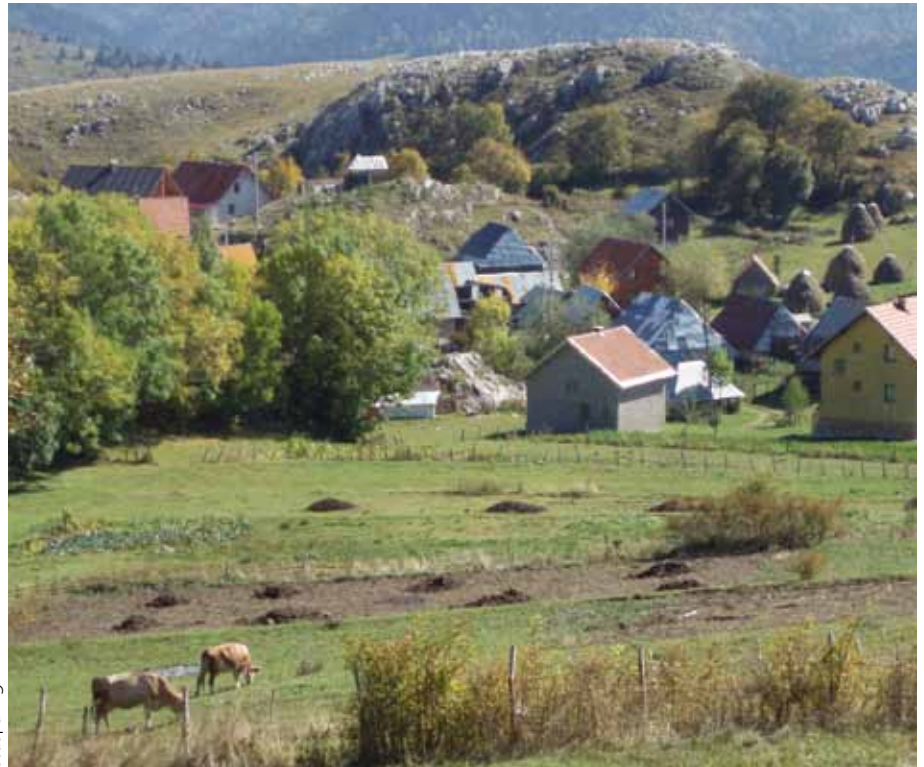
Small-scale mixed farming in eastern Europe.

Each score should have an equivalent value in terms of payment. Capping could be envisaged in order to avoid a dilution