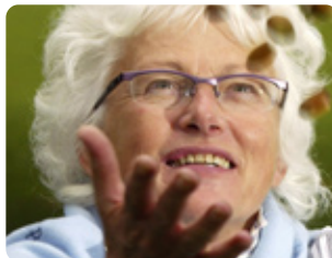
One of the participants: Euro-commissioner Mariann Fischer-Boel

Conference initiators are the Eemlandhoeve and LEI – Wageningen UR.