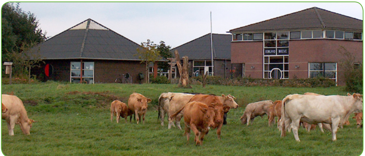
The Eemlandhoeve in Bunschoten, the Netherlands

Mail these to registration@eeconference.eu