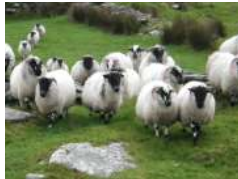
Plate 4 and 5. Left photo shows a traditional Kerry cow outwintered on the lowlands, right photo shows the traditional blackface ewe found in the uplands although brought down to the in-bye land at different times of the year.

Within the area there are still some farmers operating this basic system but over the years there have been changes. Changes in agricultural subsidies lead to an dramatic increase in sheep numbers in the 1980s and 1990s and now the Iveragh uplands are exclusively associated with sheep production. Cattle production in the form of suckler cows still exists in the lowland farms of the peninsula. On many farms sheep are brought down from the hills during the lambing period to the in-bye land and/or housed. Supplementary feeding with hay and concentrate form the bulk of the sheeps diet. The sheep are also moved down to the in-bye land at mating time, a process known as flushing, which increases the number of twin lambs.