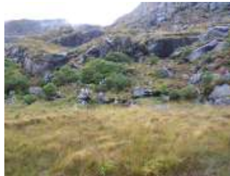
Plates 12 and 13. An example of undermanagement in the uplands. On the left, a once active farm now slowly being engulfed with Gorse ( Ulex europaeus ) and right Rhododendron ( Rhododendron ponticum ) starting to spread in the mountains.