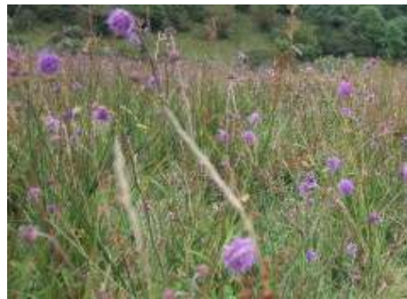
Plate 7 and 8. The Marsh Fritillary butterfly, an Annex II species on the EU Habitats Directive with its feed source, Devil's Bit Scabious, on the right.

Another important species found in Kerry is the Natterjack Toad ( Bufo calamita ). Its natural range is confined to a small number of coastal sites on the Dingle and Iveragh peninsulas. Historically the species has been recorded right along this Kerry coastal strip. The NPWS have been active in recent years encouraging the creation of new ponds to extend their range and allow migration between breeding sites (Plate 9). The continued survival of the Natterjack toad is dependant on the farming community.