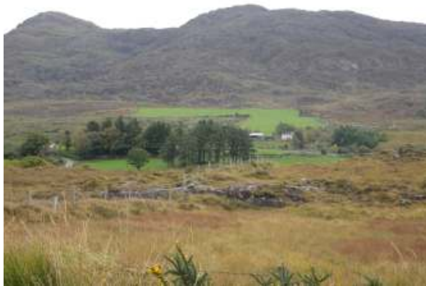
Plate 1. An isolated farmhouse on the Iveragh peninsula with its green in-bye land reclaimed from the mountain.

peninsula are major towns, the interior of the peninsula remain relatively isolated with a dispersed pattern of settlement characteristic of pastoralist traditions in Ireland (Plate 1).