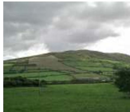
Plates 11 and 12. Examples of present day reclamation encroaching into the mountain vegetation on the Iveragh peninsula.

In addition to direct intensification through reclamation and reseeding, the effects of indirect intensification are evident throughout the peninsula. Indirect intensification is where the changes in management over the years have resulted in a change of vegetation from semi-natural to semi-improved grassland, which leads to a reduction in plant species number. This has been as a result of increased fertilisation and higher stocking rates. Field studies have shown in general plant diversity is significantly reduced even for fertiliser levels which are low in comparison to normal application