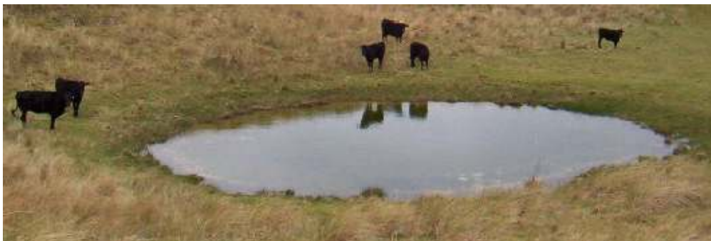
Plate 9. A photo from the NPWS information leaflet highlighting the importance of grazing around the ponds to provide forage areas for the Natterjack Toad.

Another important species found in Kerry is the Natterjack Toad ( Bufo calamita ). Its natural range is confined to a small number of coastal sites on the Dingle and Iveragh peninsulas. Historically the species has been recorded right along this Kerry coastal strip. The NPWS have been active in recent years encouraging the creation of new ponds to extend their range and allow migration between breeding sites (Plate 9). The continued survival of the Natterjack toad is dependant on the farming community.