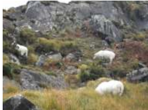
Plate 2 and 3. On the left mixed grazing of cattle and sheep on a Kerry farm with sheep grazing in the uplands in the photo on the right.

The traditional sheep system has been recorded by O'Rourke and Kramm (2009). The sheep remained outdoors all year round, being brought to the green land around the lambing period, at the end of March or in early April. They remained there until strong enough to follow their mothers up the hills for summer grazing, around early June. Store lambs were traditionally sold in the autumn (August/September) to lowland producers for fattening. Some cattle were also kept on the farm which were put to the hill during the summer. The Kerry cow, a traditional breed of cow, was common (Plate 4). Some of the green land was used for the production of hay to feed the cattle in the winter period which were often housed in small byres. The cattle manure produced was an important source of nutrients for the potato crop.