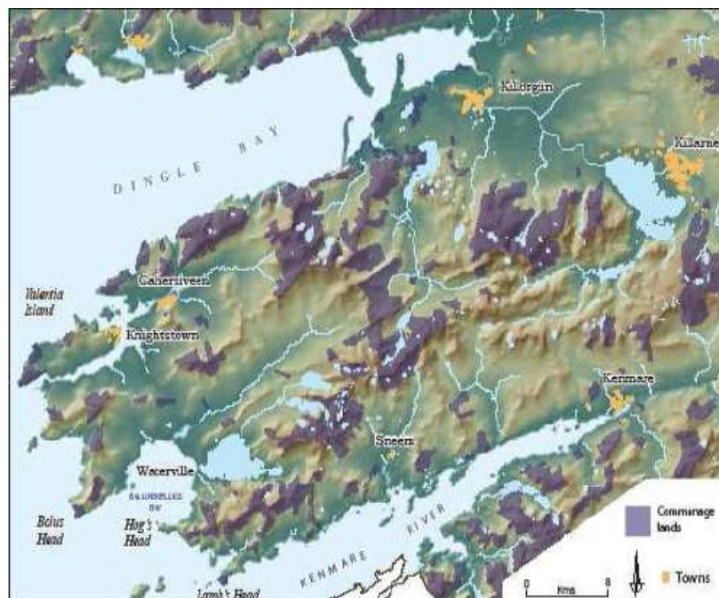
Figure 2. Map of the Iveragh Peninsula showing commonage areas

Commonages suffered from overgrazing in the 1980s when livestock premia schemes were introduced in the form of headage payments with the introduction of the European Mountain Lamb and Hoggett Ewe Scheme in the 1970s (Directive 75/268) and the introduction of the European Ewe premium in 1980 (Regulation 1837/80). This naturally led to an expansion in sheep numbers. O'Rourke and Kramm (2009) stated that according to local farmers the average mountain stocking density went from one sheep per 0.40ha to greater than 2 sheep per 0.40ha. Overgrazing had a severe effect on the hills with the disappearance of dwarf shrubs such as heather and bilberry and the dominance of a grass and sedge species poor vegetation (Plate 6).