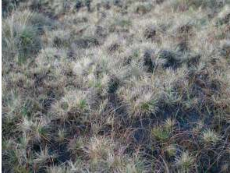
Plate 6. A sward dominated with Mat grass ( Nardus Stricta ) as a result of overgrazing

The overgrazing problems led the government to introduce the Commonage Framework Plan (CFP) in 1998 which brought about a compulsory destocking on all commonages. On inspection by a team of experts the destocking levels could be raised by 100 percent. The farmers were compensated for all animals destocked through the Rural Environmental Protection Scheme (REPS) or by Dúchas. The Dúchas Scheme paid compensation on the basis of proven loss of income, while REPS payments were fixed and were area based.