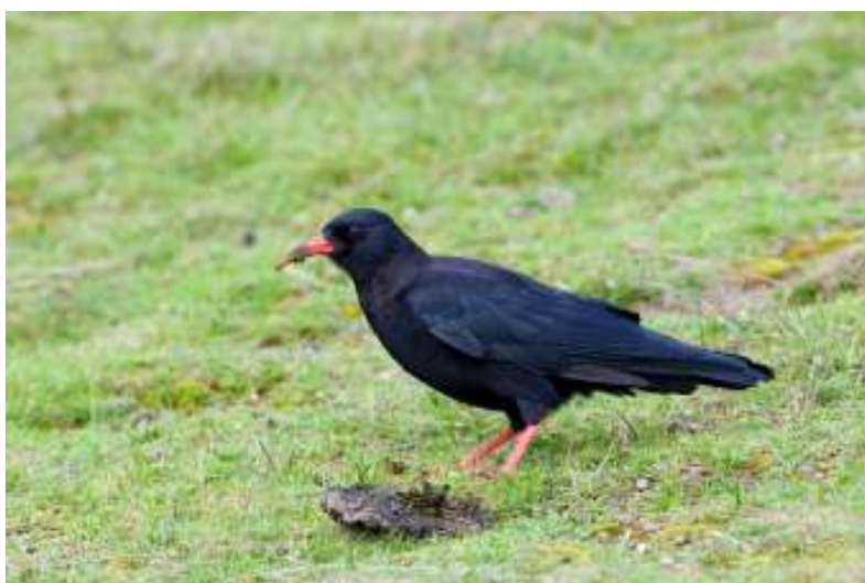
Plate 10. The Chough thrives where low intensity farming systems occur close to suitable nesting sites. Iveragh peninsula is an important European nesting site for the Chough.

The decline in numbers in the Antrim coast is thought to have been due to the loss of semi-natural grasslands and coastal heaths through intensification of grazing management, increased housing of cattle in the winter and improved veterinary products (DOE, 2000). While on the Aran islands a fall in numbers on Inish Mór may be linked to a decline in grazing on the island (Gray et al.2003).