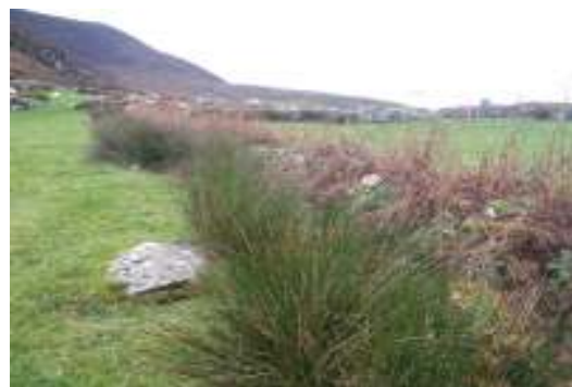
Plate 15 and 16. On the left, a machine used to grind gorse for use as a livestock feed on a farm in Kerry. On the right the spread of soft rush and bracken presently confined to the boundaries as a result of active management.

Kramm et al. (2010) found that the higher the percentage of scrub on a site, the lower the plant diversity. An intermediate level of litter resulted in the highest plant diversity. This is in accordance with the work of Morris (2000) who showed that stocking rates too low produce patches of tall rank vegetation and the accumulation of dead vegetation and litter are depressive for plant seed germination. Although this is favourable for some invertebrate species like spiders, at a very low stocking rate the density of the sward and litter layer means that invertebrates are generally not really